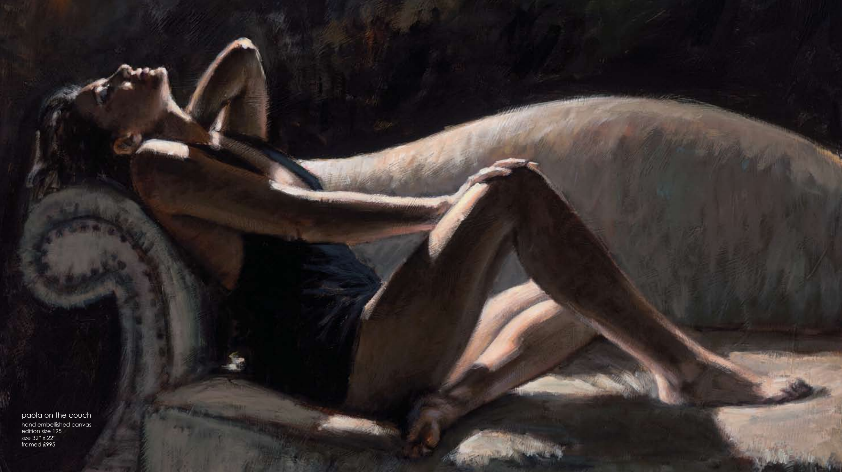
paola on the couch hand embellished canvas edition size 195 size 32" x 22" framed £995