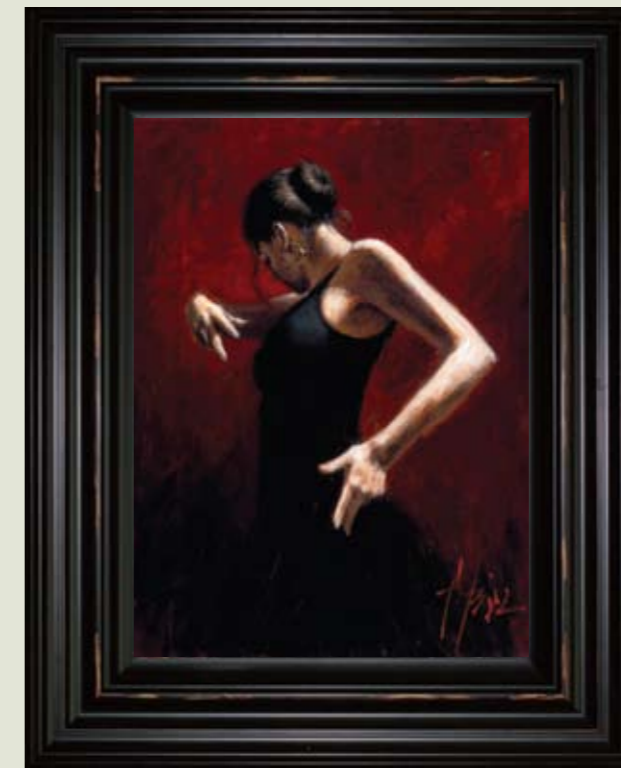
el baile del flamenco en rojo I