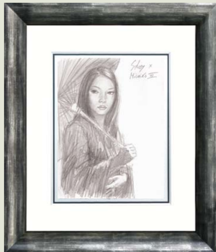
study for michiko III paper edition edition size 195 size 12" x 16" framed £395