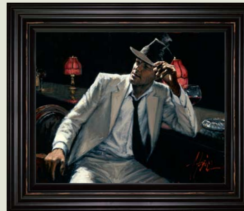
man in white suit V hand embellished canvas edition size 195 size 30" x 24" framed £995

Fabián Pérez's powerful and virtuosic compositions have brought figurative artwork right to the forefront of the international art world. His reputation and the sheer impact of his work has made him the most exciting figurative artist on the contemporary scene.