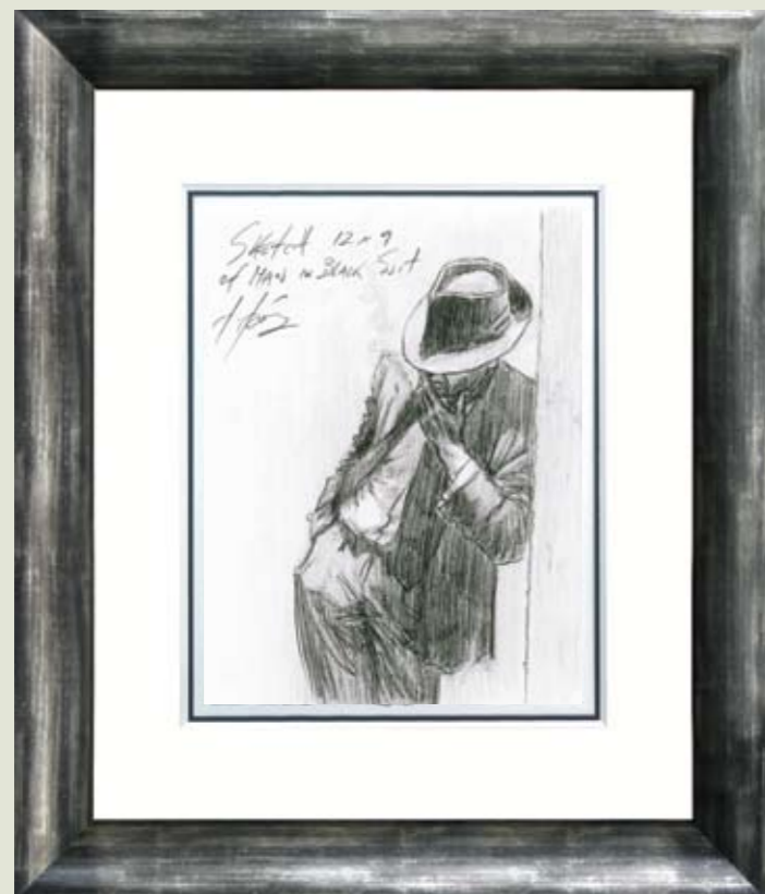
sketch of man in black suit paper edition edition size 195 size 12" x 16" framed £395