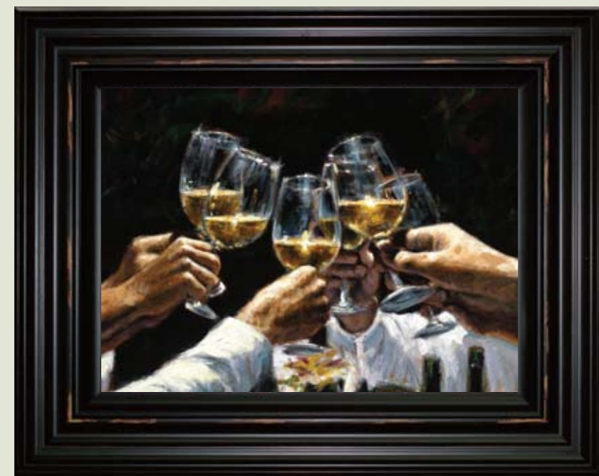
for a better life II hand embellished canvas edition size 195 size 22" x 16" framed £695

While many of Fabian's paintings are concerned with emotions such as passion and desire, camaraderie is also a recurring theme. This bond of friendship, often between men, is both symbolised and celebrated in this magnificent still life.