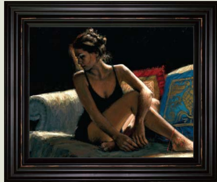
rojo y azul hand embellished canvas edition size 195 size 30" x 24" framed £995

© DeMontfort Fine Art www.demontfortfineart.co.uk