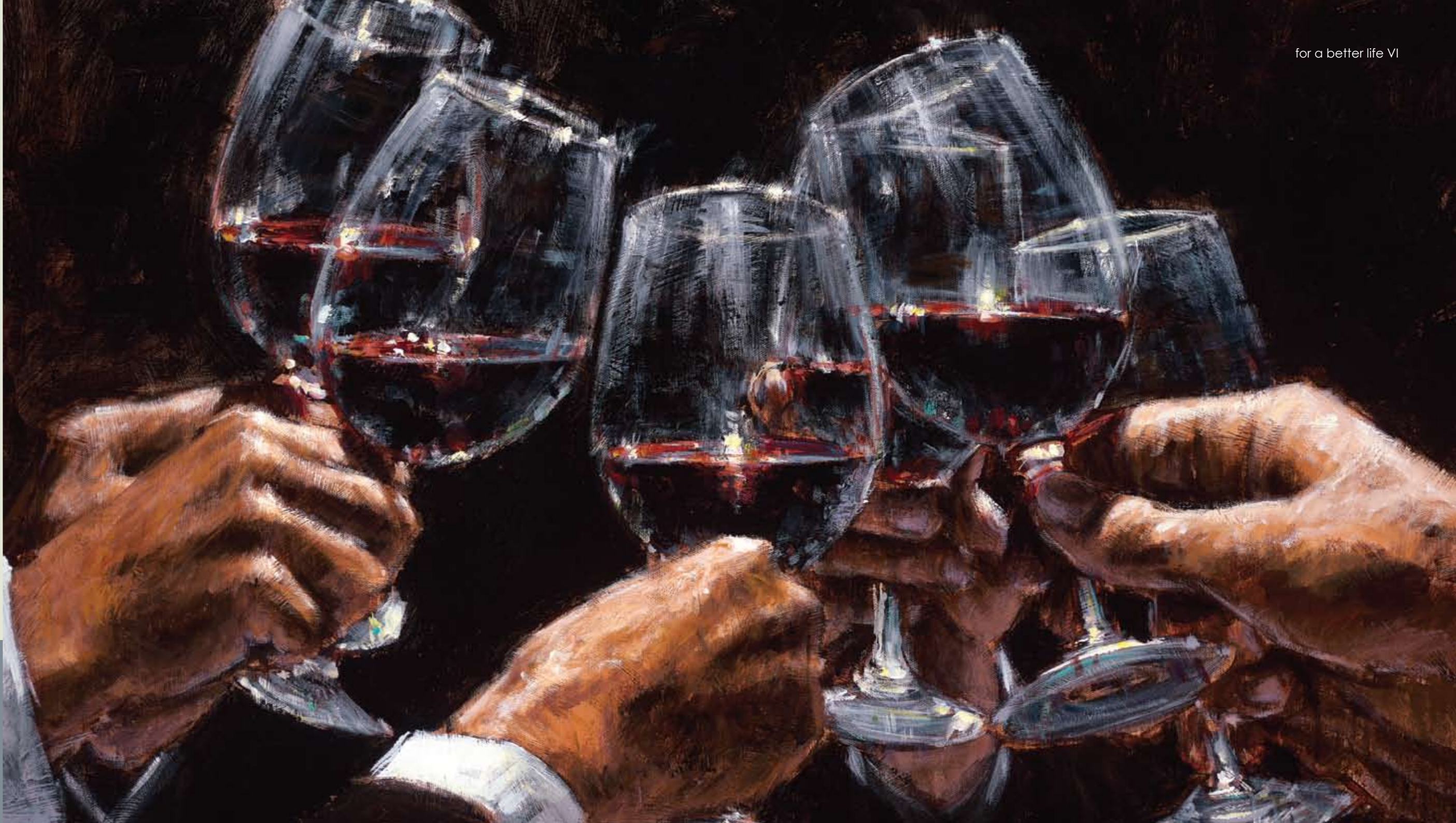
for a better life VI