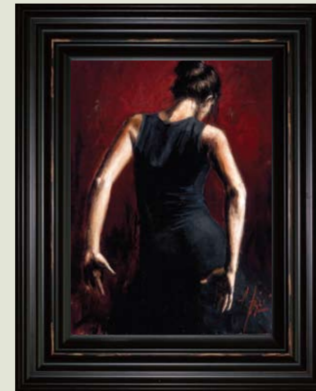
el baile del flamenco en rojo II hand embellished canvas edition size 195 size 16" x 22" framed £695

The warmth and humanity of Fabian's female subjects is as central to his images as their beauty and seductiveness. Like Toulouse Lautrec, whose vibrant but humorous portrayals of the Moulin Rouge cancan dancers offered us a uniquely intimate view of these extraordinary women, it is Fabian's closeness to the reality of his subjects that sets him apart from other artists who might paint such figures from a greater distance.