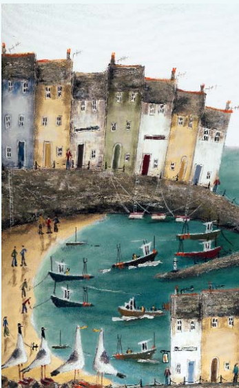
HEADING HOME I