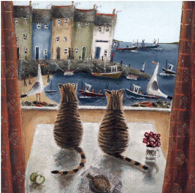
CHECKING THE CATCH