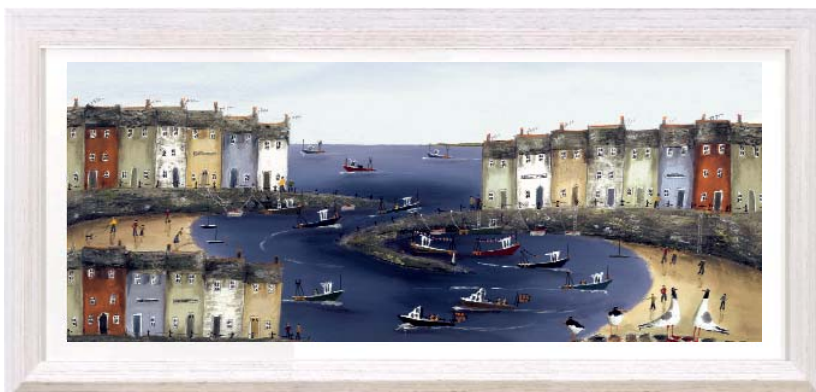
A FISHERMAN'S TALE