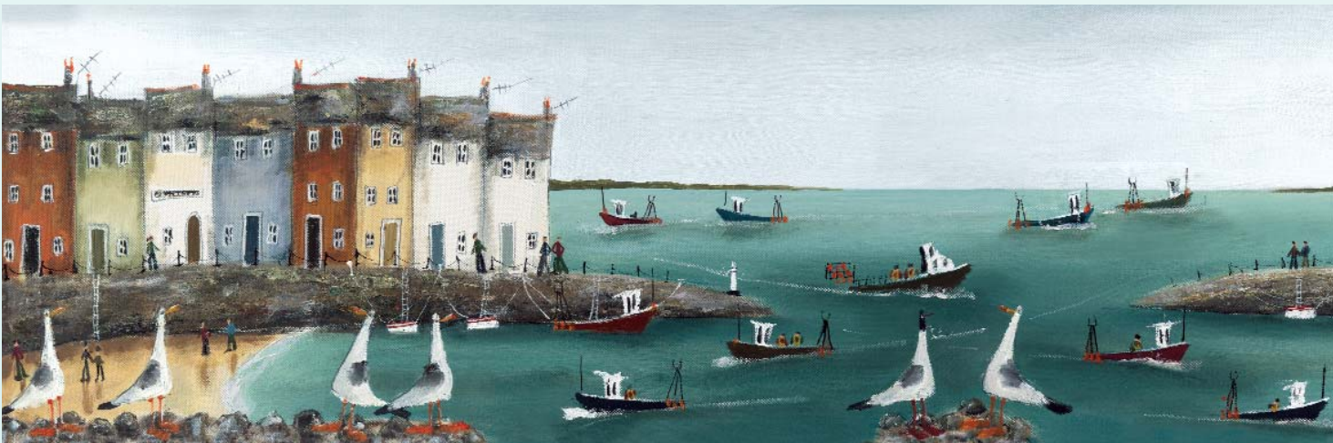
PORT AND STARBOARD

Signed Limited Edition Giclée on Paper Edition Size 195 10" x 16" RRP Framed £210