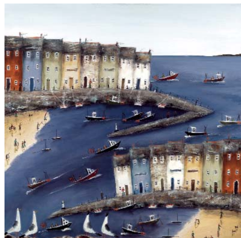
ANCHORS AWAY II