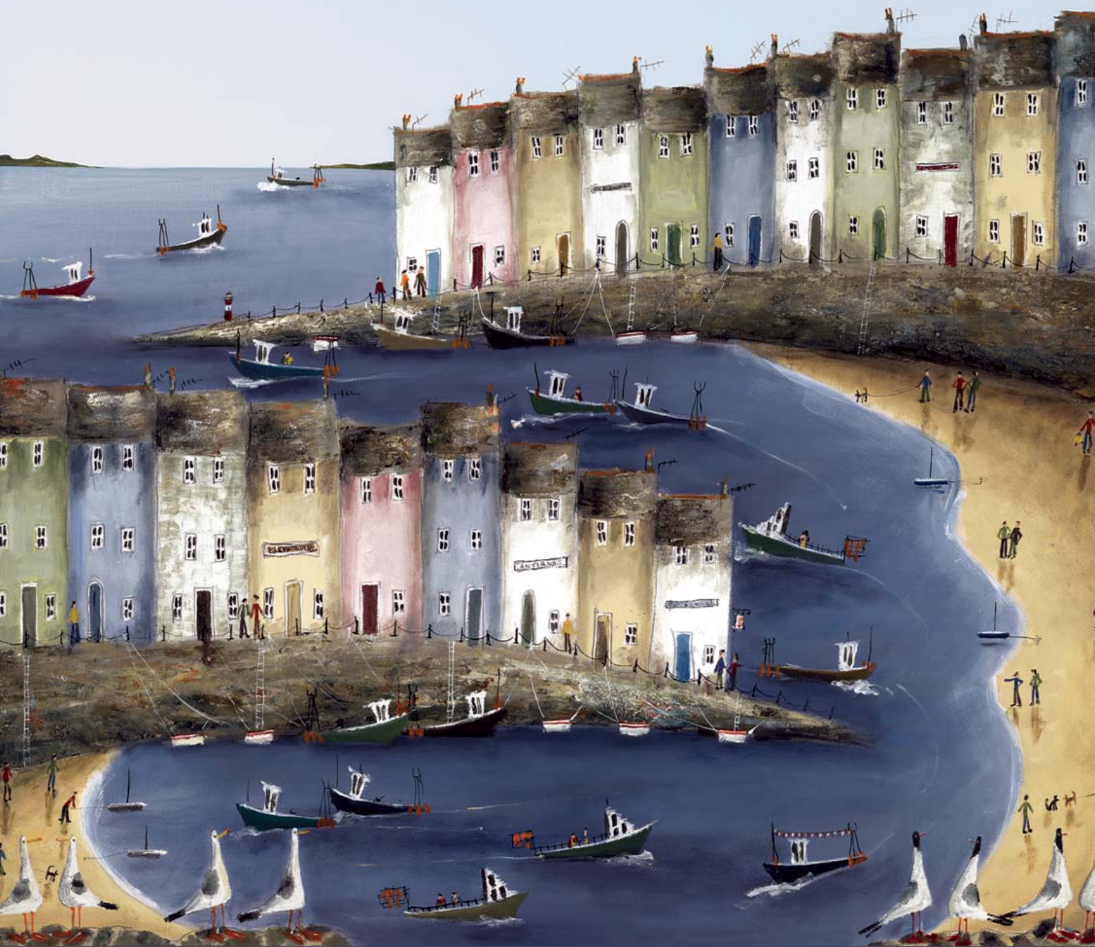
RIDING THE WAVES