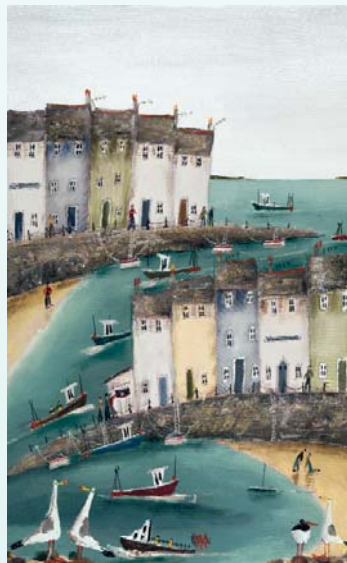
HEADING HOME II